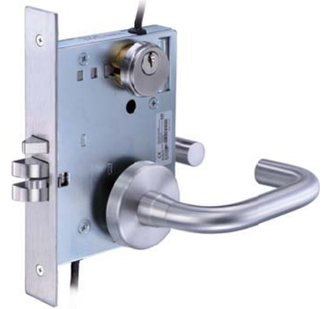
GEM800-SET with L814 Lever Option