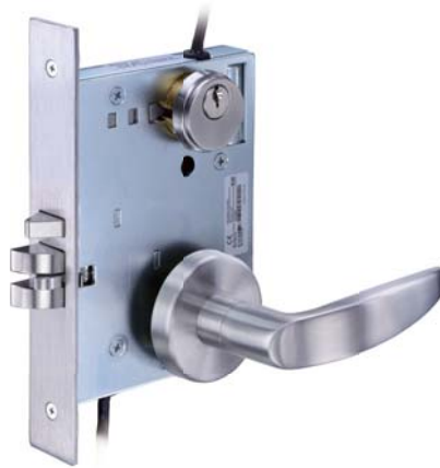
GEM800-SET with L812 Lever Option