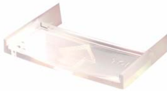
P-PL-CP-32-K Reset key